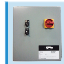
Optional UL & ETL listed control panel