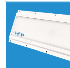
Industry-leading LED lighting with 5-year warranty